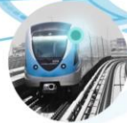
High Speed Rail (THSR)