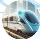
High Speed Rail (THSR)